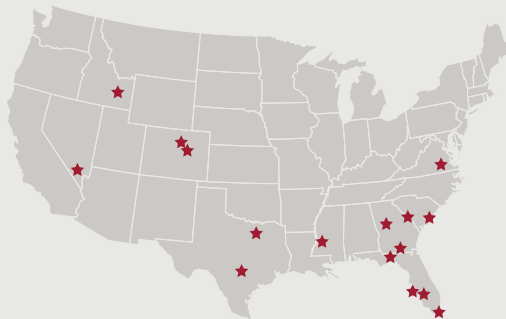
*JMS BURN CENTERS, INC. LOCATIONS