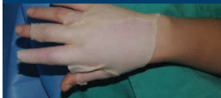
A thin layer of skin harvested from a pig.