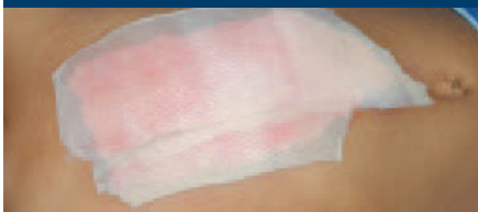
Human skin donated for medical use post-mortem.